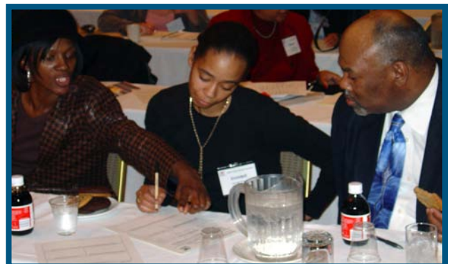
Summit attendees brainstorm and create action plans.

The day also included time for attendees to brainstorm together and begin their own plan for action and next steps to help them put to use the information gathered during the summit. Participants' responses to the summit included: "I'm so lucky to have been here." "The conference was very well organized; the sessions, the rotation, the materials—everything." "The parent-friendly structure was refreshing."