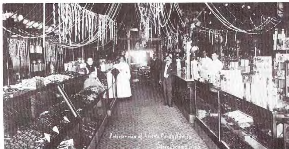
Lincoln Candy Kitchen on Kickapoo Street in downtown Lincoln, about 1905.

Bennis was in the process of building the Auto-Vue drive-in theatre, on the northeast edge of Lincoln, when the Lincoln Drive-In opened at the east end of Broadway in 1950. So Lincoln had two drive-in theaters, until the Lincoln Drive-In was destroyed by a storm in 1954. The Auto-Vue stayed open through the summer of 1982; also in 1982, the Lincoln Theatre was sold to the Kerasotes theatre chain. ■