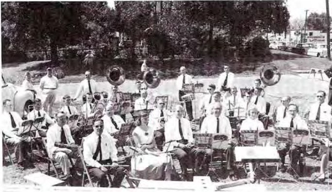
The American Legion Band in 1958.