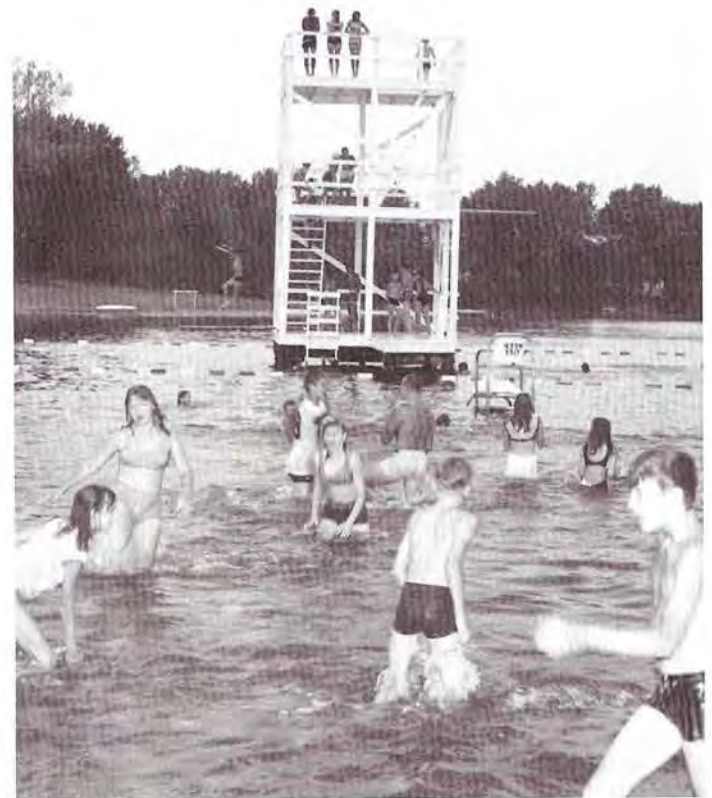
Tri-Police Swim Party at Lincoln Lakes.