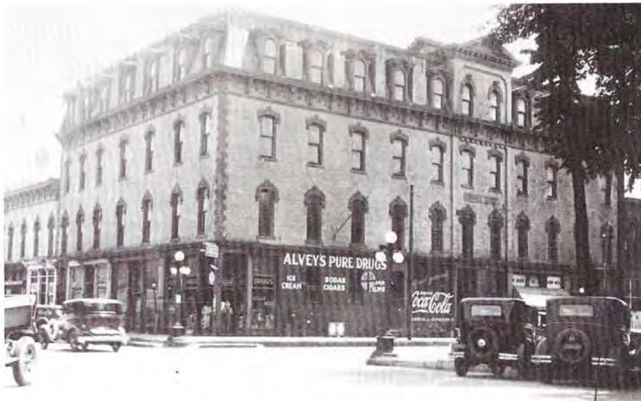
Alvey's Drug Store in the Lincoln House, 1932.

In 1936, movies were so important that reviews were printed in the Lincoln Evening Courier next to the ads. Moviegoers could choose from the Grand (built in 1895 as an opera house for vaudeville and stage shows), the Vogue, and the Lincoln. On Friday, January 3rd of 1936, the stage show "Lightnin'," played at the Grand with 40 people in the cast and orchestra. Saturday night brought the movie "Chinatown Squad," along with chapter 7 of "Burn 'Em Up Barnes," a cartoon, and the comedy, "My Girl Sally."