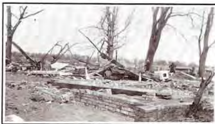
Oakland School site after the 1927 tornado.