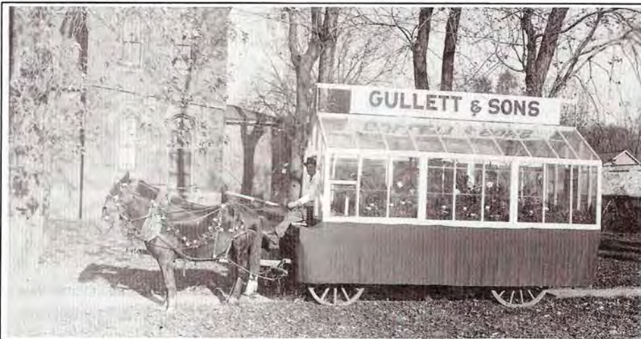
Gullett and Sons delivery wagon.