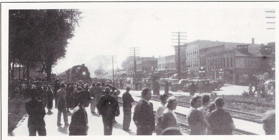
Train carrying President Franklin D. Roosevelt stops in Lincoln, c.1936.