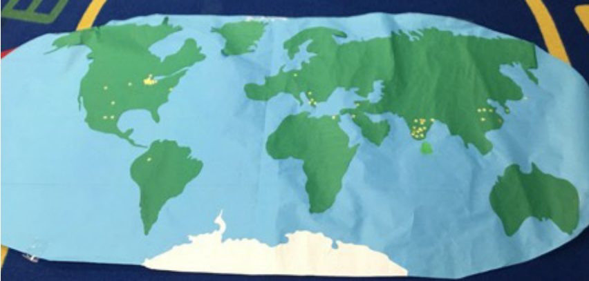
Figure 4. Map on Which Families Indicated Their Heritage Country