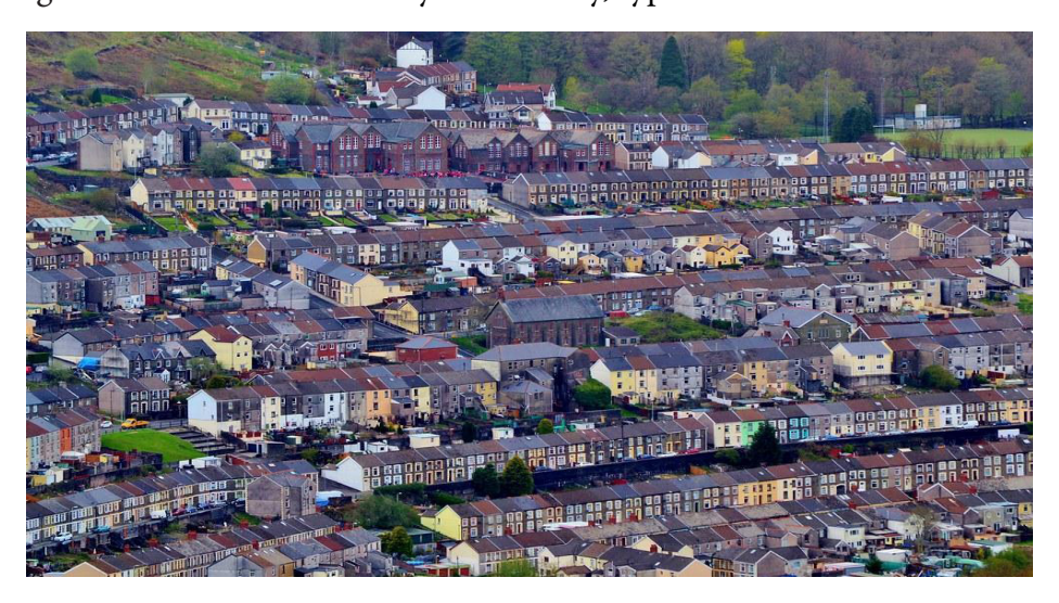
Figure 3. A South Wales Valley community, typical of the research site

As can be seen, a typical valley community consists of several hundred terraced houses clustered around where the deep coal mine once stood. It has a distinct geographic boundary, and at its heart stands the local community primary school. The meandering, snake-like rows of terraced housing