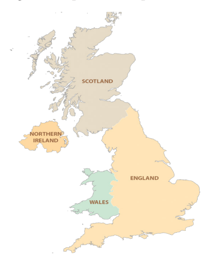
Figure 1. A political map of the U.K.

Wales is a constituent part of the United Kingdom (U.K.). England borders it to the east, the Irish Sea to the north and west, the Celtic Sea to the southwest, and the Bristol Channel to the south. It has a population of just over 3 million, compared to England's 56 million, and in size is slightly smaller than the United States of America's state of New Jersey. Figure 1 is a political map of the U.K. showing England, Scotland, Northern Ireland, and Wales.